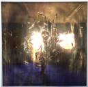
THE SCREAM, 2019 Silver chroming process, AR15 bullets, and mixed media on linen on wood 60 x 60 inches / 152.4 x 152.4 cm