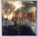
FERTILIZING THE NEKROVULA, 2019 Silver chroming process and mixed media on linen on wood 60 x 60 inches / 152.4 x 152.4 cm